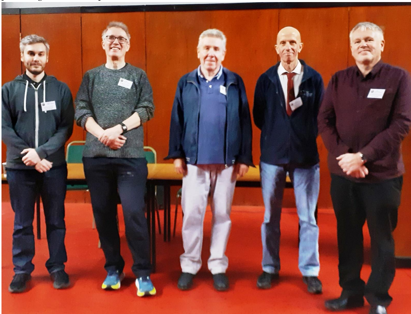
Speakers for the SHA 2023 autumn conference.